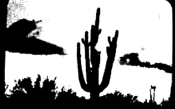
"TO HARNESS THE SUN" Arizona's involvement in solar energy

Standing with Arizona for 96 years AJU • BISBEE • DOUGLAS METCALFE • MORENO Also at Tyrone and Playas, New Mexico