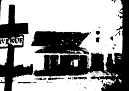
"WHAT'S IN A NAME" Colorful names and places in Arizona