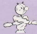
Incomplete Forward Pass, Penalty Declined, No Play or No Score