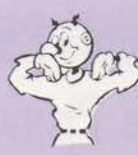
Ball Illegally Touched, Kicked or Batted