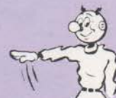
Personal Foul (Tripping, hurdling, tackling out of bounds)