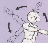
Start the Clock or No More Time-Outs Allowed