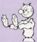
Forward Pass or Kick Catching Interference