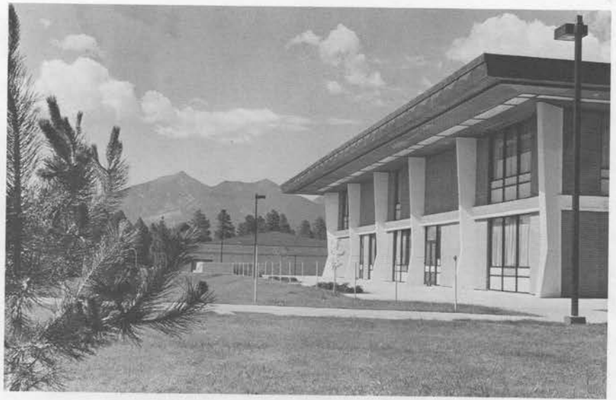
SOUTH ACADEMIC CENTER—UNION BUILDING AND STUDY CENTER

Located near the center of Flagstaff on Northern Arizona's 6,800-foot-high Coconino Plateau, the University's 677-acre, tree-shaded campus is noted for its green beauty. It sprawls in the shadow of the 12,800-foot San Francisco Peaks and within the Coconino National Forest, the largest stand of majestic Ponderosa pine in the world.