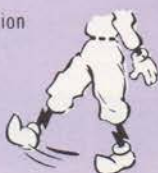
Roughing the Kicker